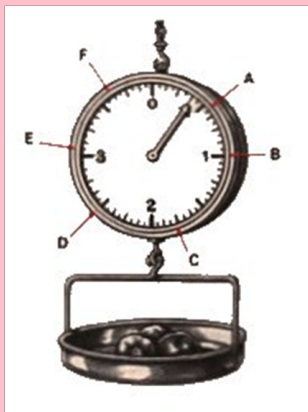
A Spring Scale