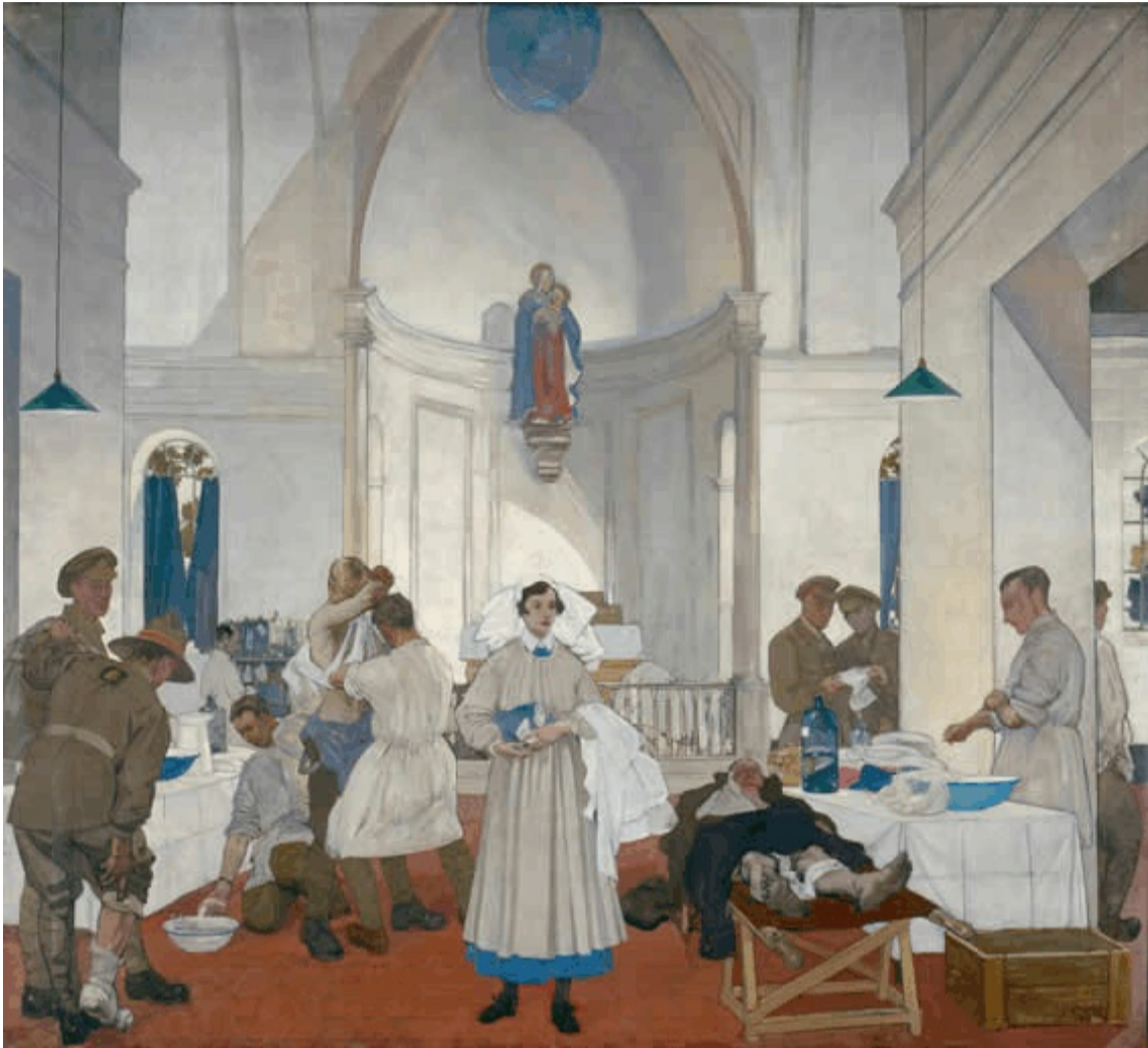
No. 3 Canadian Stationary Hospital at Doullens Painted by Gerald Edward Moira Beaverbrook Collection of War Art

Interpret the following Canadian painting by answering the following questions.