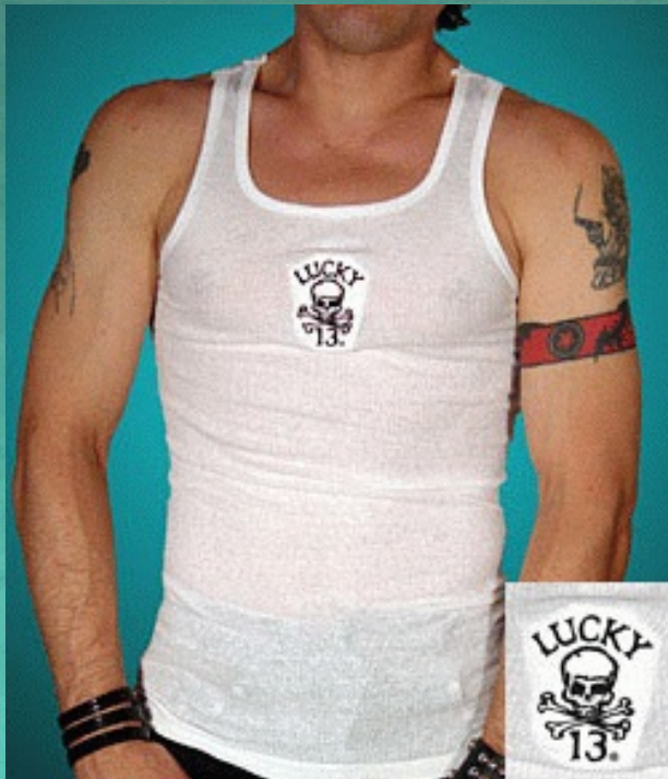
Not Appropriate Style of T-Shirt